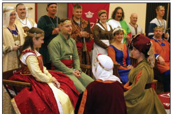
Top: The populace swears fealty to the Crown Middle-Right: The finals of the newcomers tournament. Above: Their Majesties enjoy the activities on the list. Right: Greyfells business during Baronial Court.