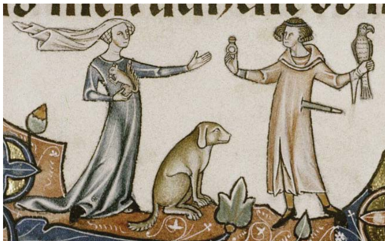
Image from The Ormesby Psalter (Bodleian Library MS. Douce 366). Found online at Chimaera: The bestiary blog. http://bestiary.ca/chimaera/

Another favourite site that I subscribe to both by RSS reader and by Twitter is the blog Medievalists.net. This hard-working blog captures a great number of the newest academic articles being published about the Middle Ages. I find that a good number of the posted articles contain more than just the abstracts, but include links to the full piece. An excellent resource in