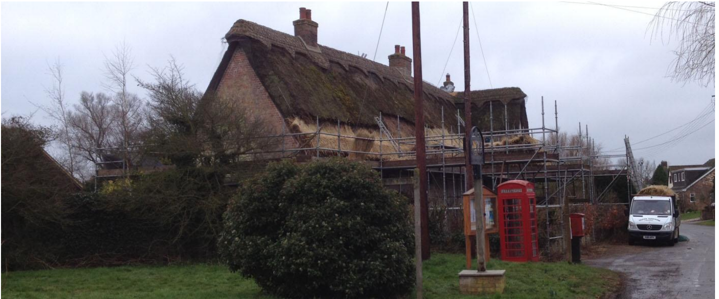
Lady Lerthan ingen Chormaicc maicc Morgaind's neighbour re-thatching their roof in Cambridgeshire, Molesworth, England photo taken by Lady Lerthan.

Thatching is the craft of building a roof with dry vegetation such as straw, water reed, sedge, rushes, or heather. The vegetation is layered to push the water away from the inner roof.