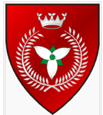
The arms of the Kingdom of Ealdormere are: Gules, a trillium flower affronty argent, barbed vert, within a laurel wreath, in chief a coronet argent.

http://ealdormere.ca/wiki/index.php?title=Ealdormere