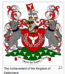
The Achievement of the Kingdom of Ealdormere

Directed specifically against Ealdormere, the Ban had a great impact on Ealdormerean culture and history.