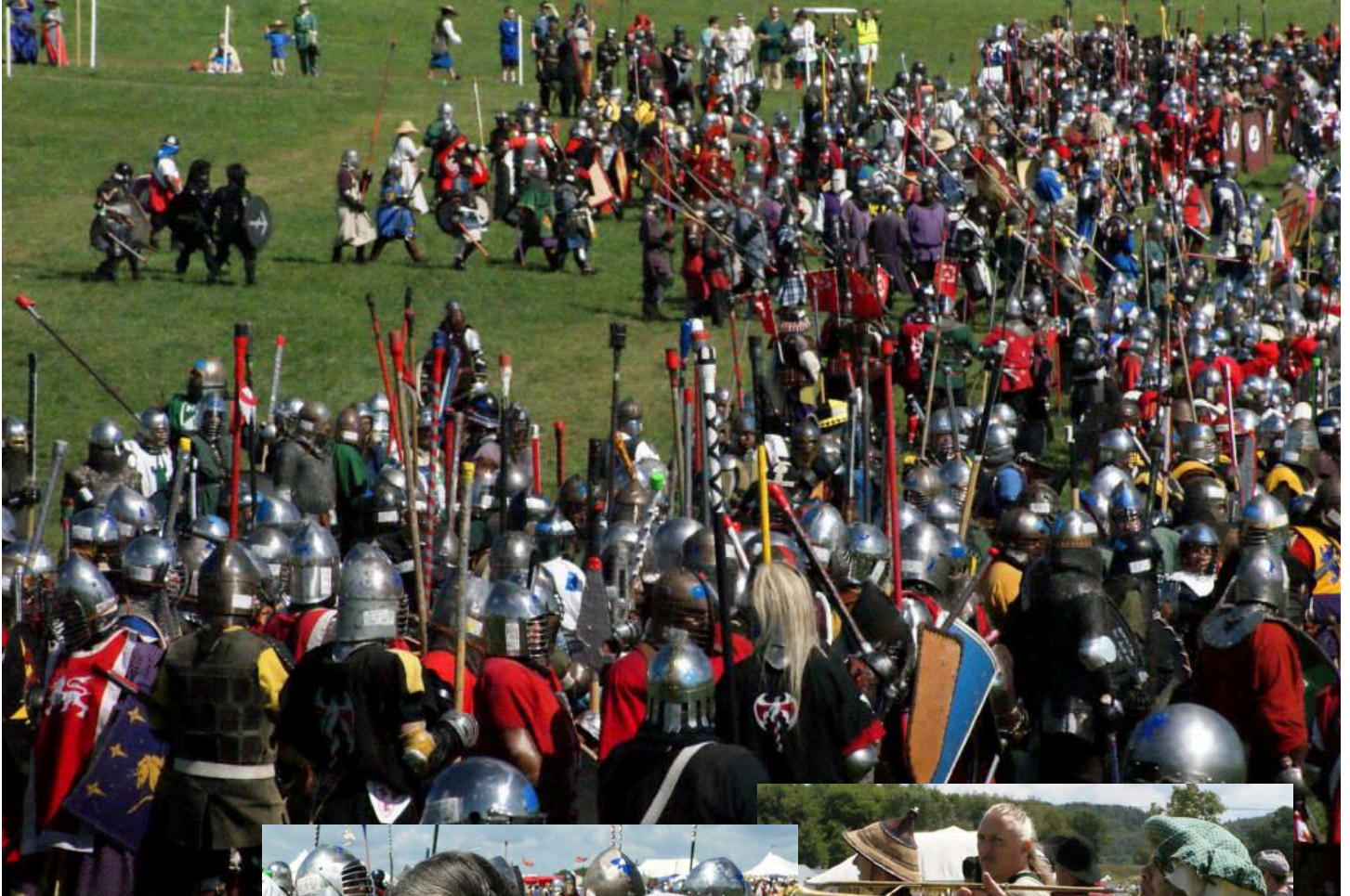
Pennsic 2013 Field Battle