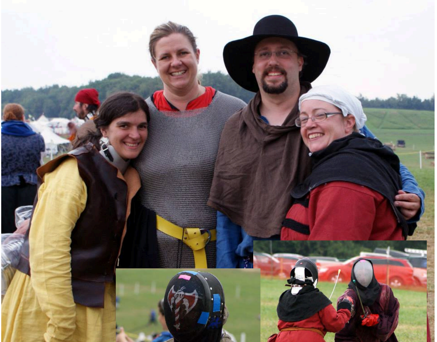
Pennsic 2013 Novice Rapier