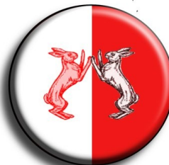
Friend of the Hare