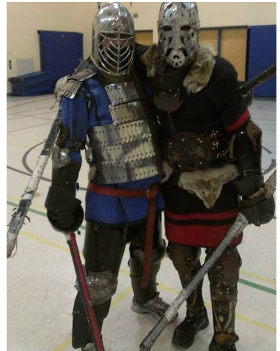
Illustration 2: Our Baron wants to fight!