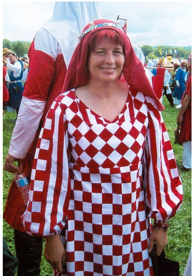
Illustration 19