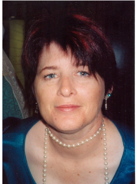
Illustration 18: Photo provided by Mistress Rozalynd

It has been many years since Kaiza and Rozalynd have done feast but she worked on six large events and several smaller ones too. Everything from a hundred loaves of bread to twenty dozen tarts! Hours of cooking in kitchen the day of, once when worked over seven hours only to realize that she had forgotten to eat – stopped the feast serving so that the head cooks could devour a whole cheese pie... it was the tastiest pie ever as all giggled around the bites as the servers watched.