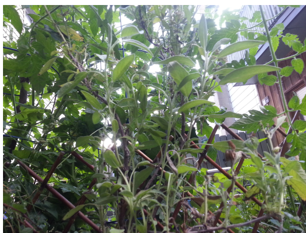
Illustration 14: Sage