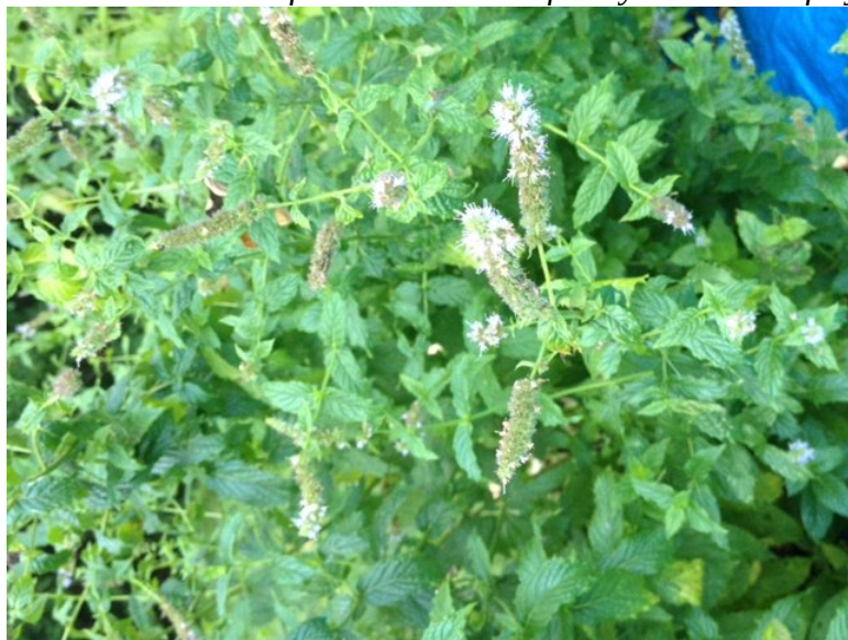
Illustration 12: Lots of mint from the Garden of Lady Elsebeth Ffarybryn