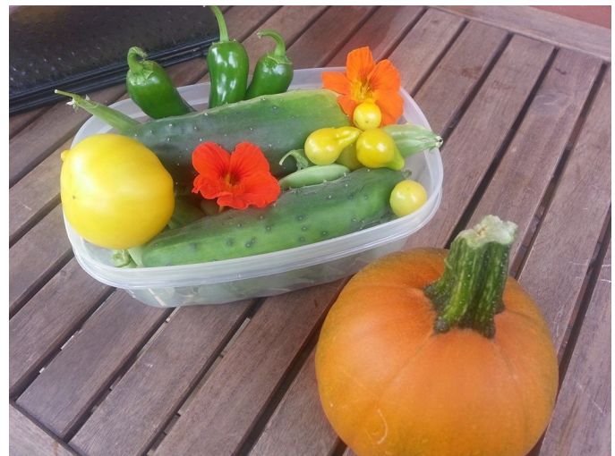
Illustration 4: Fall harvest for Lady Adeline de Preau and Jens Busse

Farewell my fellow Skraels, until next we meet. Nathanael.