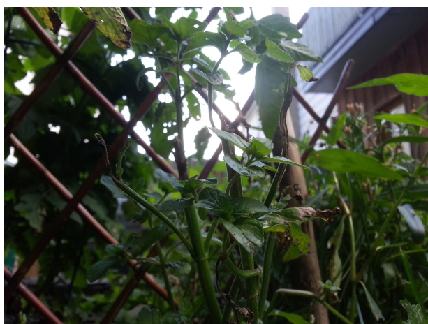
Illustration 13: Mint