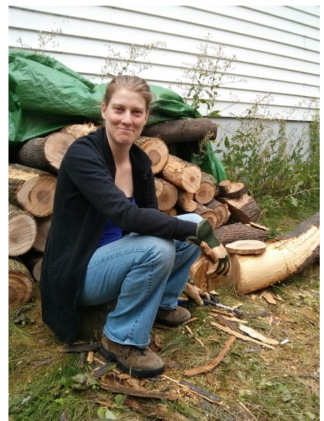
Illustration 5: Lady Aelswitha and her 'green wood' project