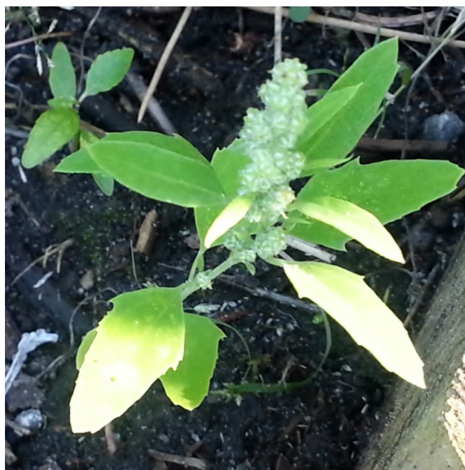
Illustration 8: Lambs quarters from Mistress Siglinde's garden.

Cook up onions in butter 'til wilted, add flour and cook up 'til mixture browns a bit.