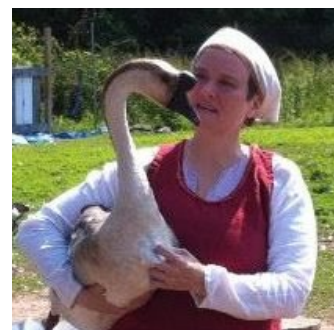
Illustration 2: Baroness Lucia with Quill