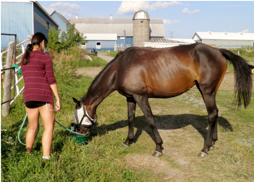
Illustration 7: Fancy, with my daughter, who is 5' 4" tall.

This summer, I bought my first horse, Fancy. She looks perfect for my daughter, but I thought she would be just barely big enough for me. However, when I looked at medieval horses, it appears that she would be relatively large for a medieval horse. She is approximately 15.1 hands high at the withers (that's about 5' 1", or 155 cm, at the highest part of the back, just behind the front legs). She currently weighs about 960 lb. From illustrations and measurements of surviving medieval horse armour in the British Royal Armouries, it appears that horses bred for military use were actually in the range of 14 to 15 hands. One well known illustration supporting this is from the Luttrell Psalter. If we assume that Lady Agnes Luttrell was of average height (5' 2"), then her eyes would be at about the height of the withers. Her husband is clearly taller, and he would have stood shoulder-to-shoulder with his horse. Many other illustrations, including the Bayeux Tapestry, show horses reaching only to the shoulder height of their riders. Even if we assume that the well-fed men and women portrayed in art were taller than average, most of the 15 th and 16 th C illustrations show horses between 14 and 15 hands. Some are even smaller.