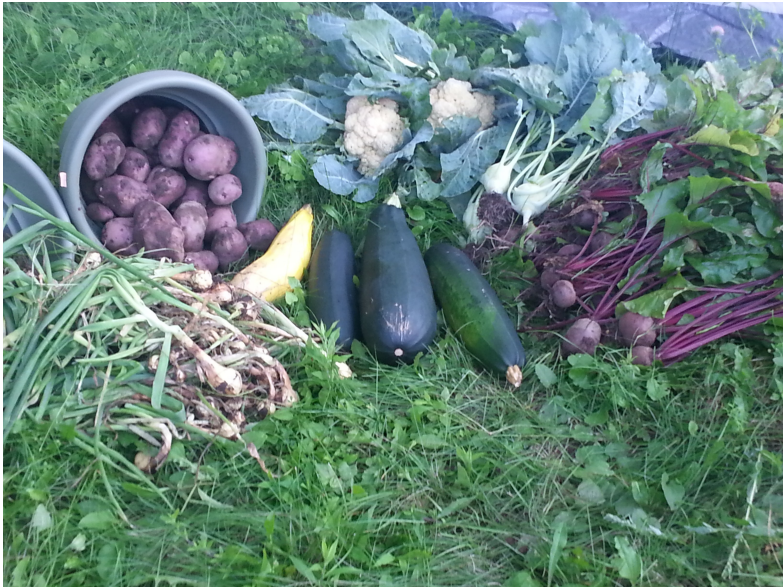
Illustration 16: Potatoes, onions, beets, karobi, cauliflower, zucchini and beets