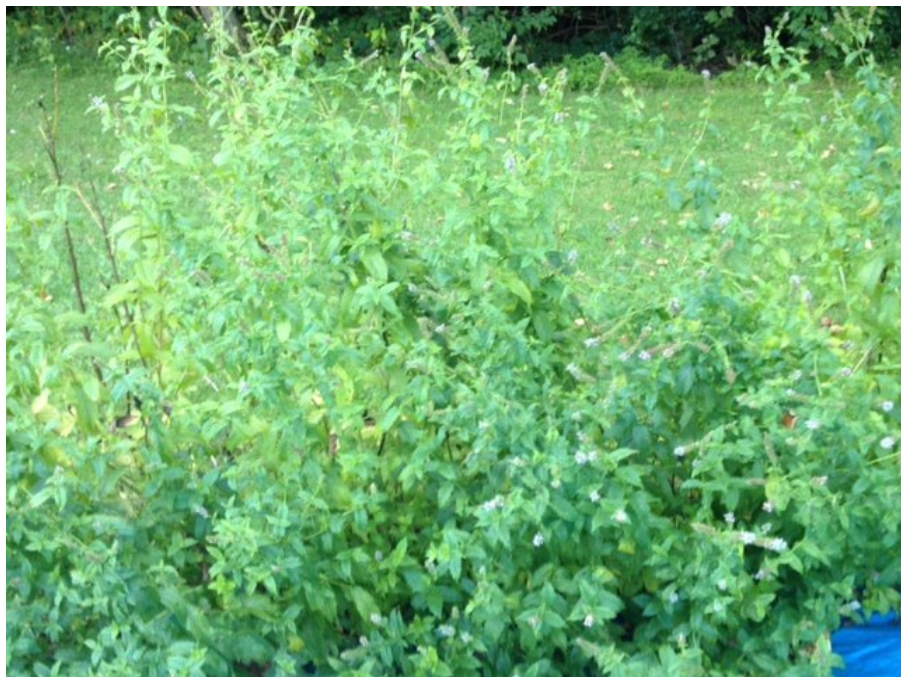
Illustration 11: Mint from the Garden of Lady Elsebeth Ffarybryn