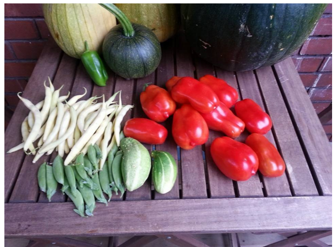
Illustration 3: Fall harvest for Lady Adeline de Preau and Jens Busse