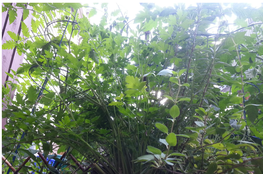
Illustration 15: Rosemary and parsley