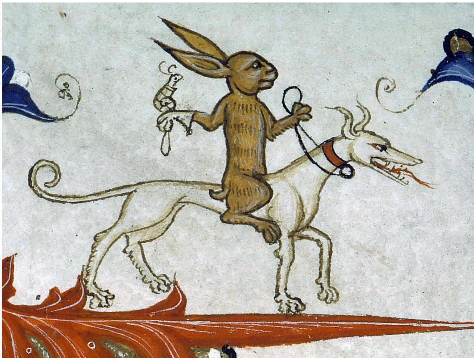
Pontifical of Guillaume Durand, Avignon, before 1390. Paris, Bibliothèque Sainte-Geneviève, ms. 143, fol. 165r