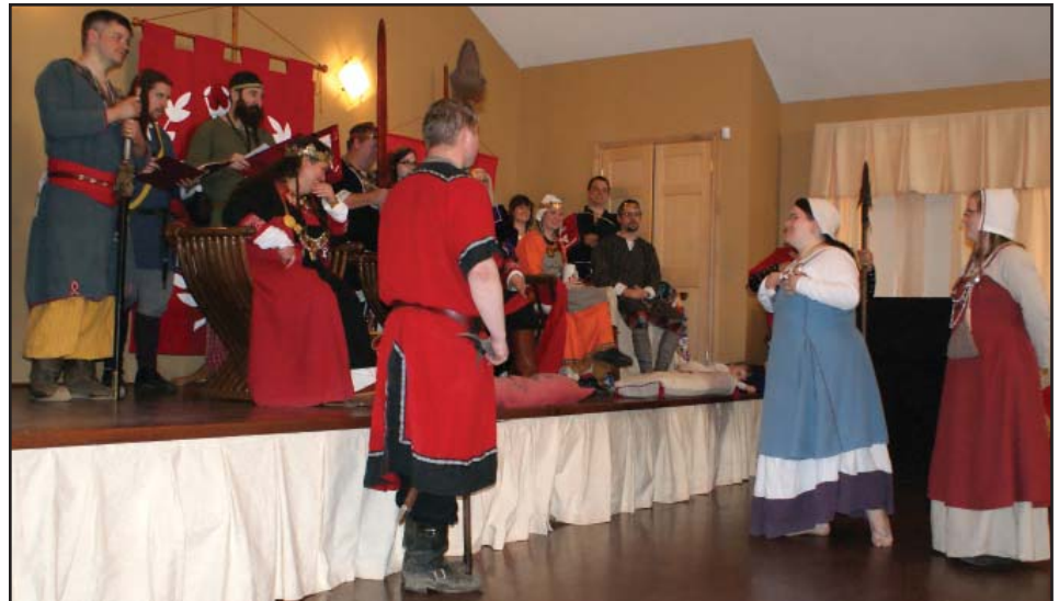
Lady Constance and Lady Eluned presenting the proceeds of the first Super Secret Dagmar Fan Club activities at Spring Coronation.

Fundraising activities arranged by the SSDFC included the sale of small membership badges, various raffles and silent auc-