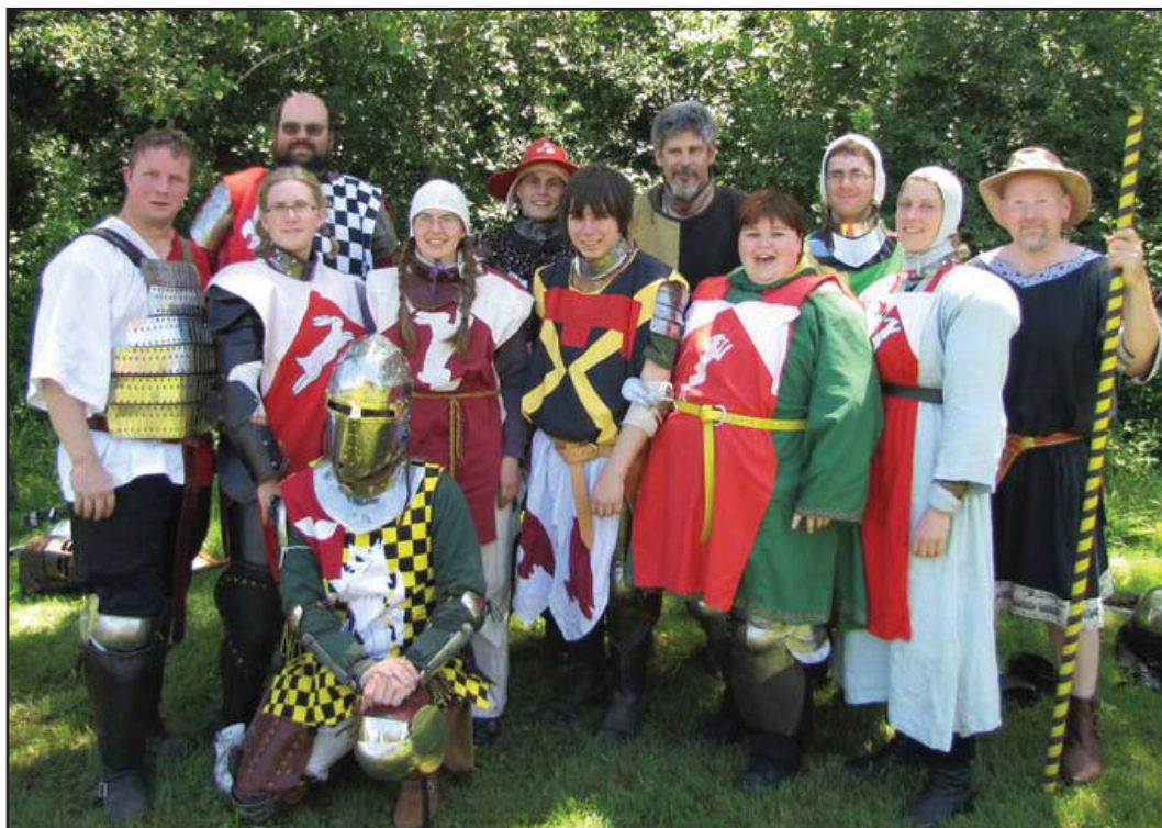
Left: The armed might of the Barony of Skraeling Althing at Trillium War.