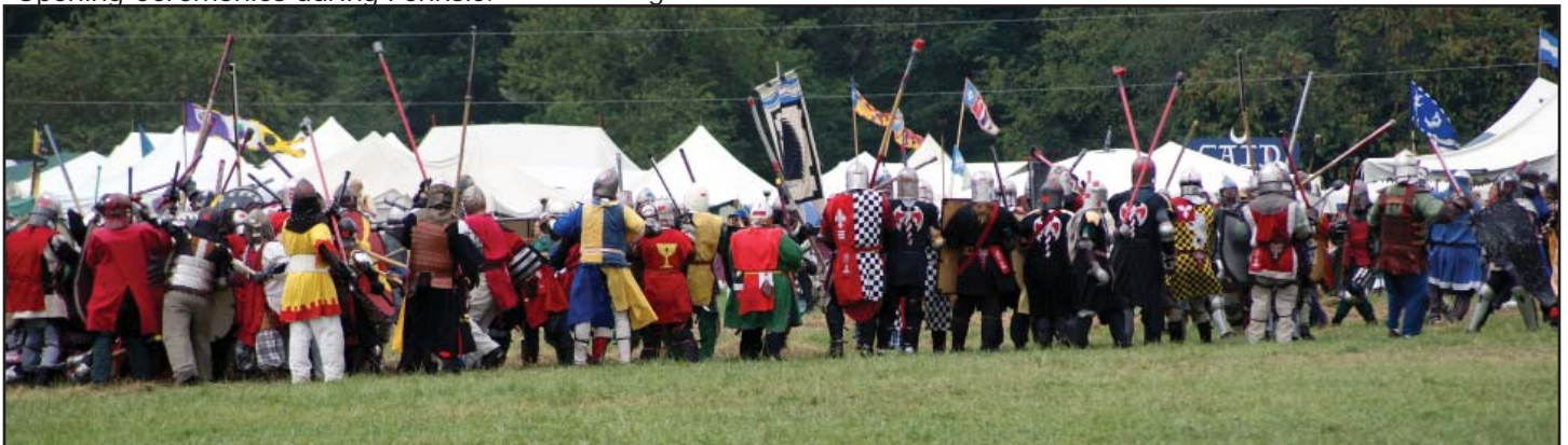
Below - Ealdormere's army during the field battle. Some of the Skrael fighters can be seen in the middle of the line.