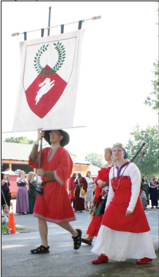
Above - Skraeling Althing marches to the Opening Ceremonies during Pennsic.