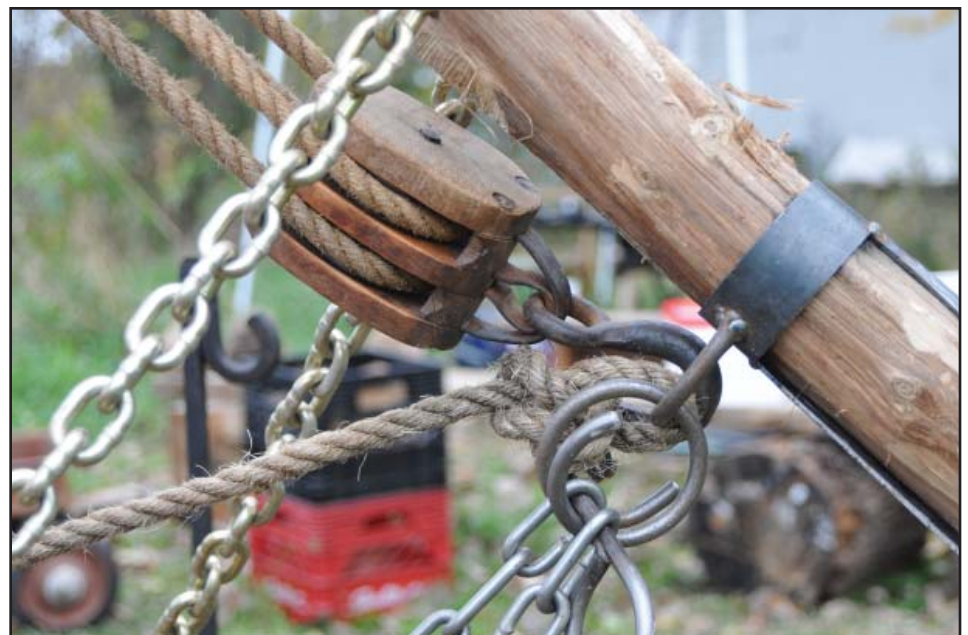
Close-up of some of the mechanical parts of the trebuchet.

Be sure to see this weapon of war in action at its official demonstration at Kingdom A&S in Greyfells!