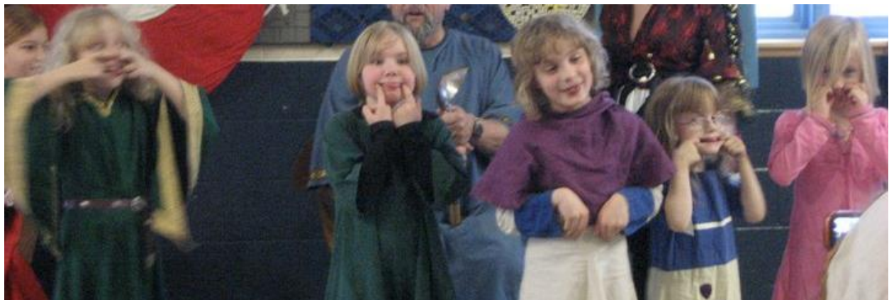
Figure 2 Funny faces competition