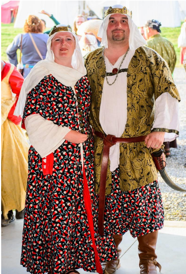
Figure 1 Baron and Baroness of Skraeling Althing

Just as Our Cantons band together to form a Barony, so do members of the populace also band together and form amazing friendships. These bonds are often closer than simple friendships, these people