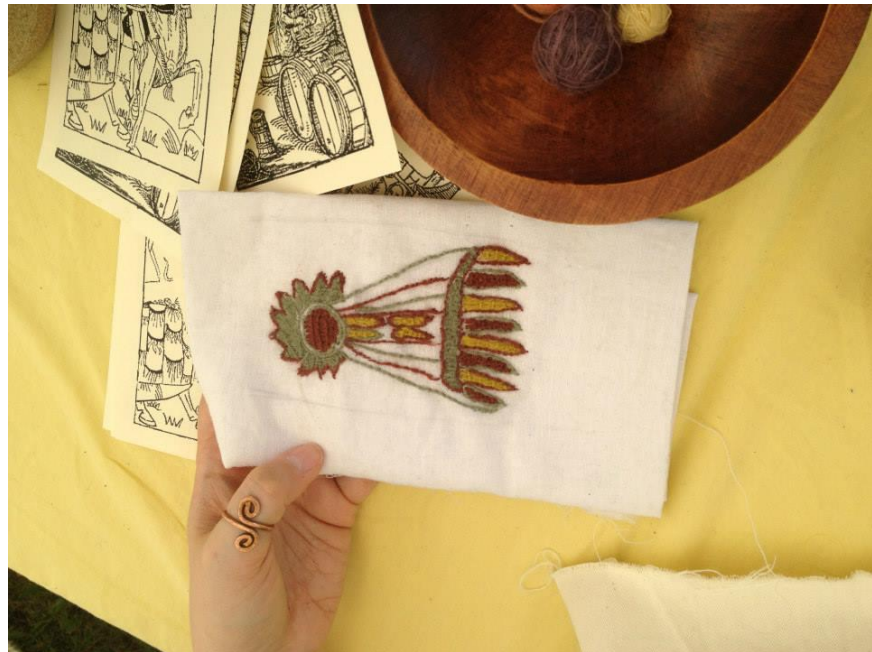
Figure 5 Grace's embroidery